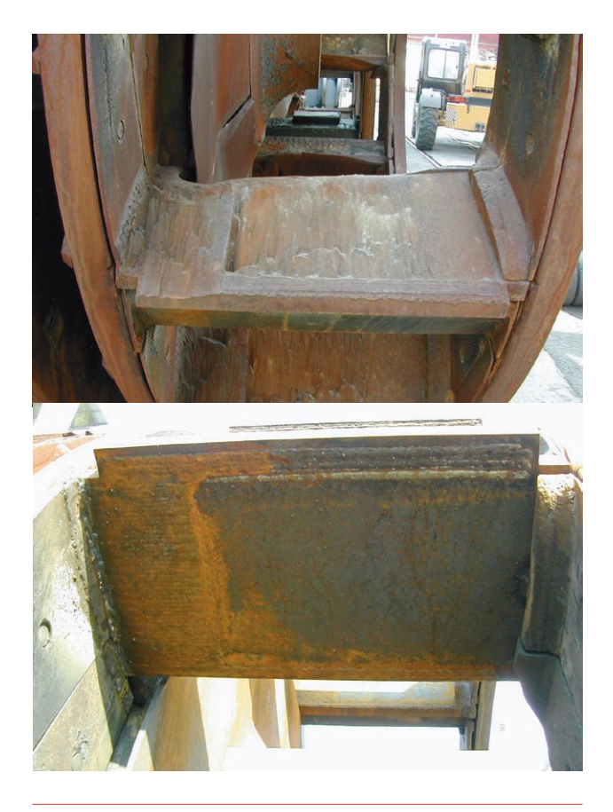
Figure 5. Impact plate with typical wear pattern (top) and partial new hardfacing (bottom).

points. In most cases, partial protection against wear through the hardfacing of these positions is sufficient to equally extend the service life of the rest of the equipment. The spiral crown of the screw is subject to extreme wear through abrasion and necessitates the partial or full surface protection of the screw against wear. This can be accomplished with hardfacing or by attaching cast parts made of bi-metal for screws with oversize diameters. Grinding rollers and grinding discs can be regenerated repeatedly with hardfacing. The welding can take place on the component while installed (in-situ) or after removal. An emergency reserve layer still exists on the wear resistant base material after the protective surface is worn down when chilled chrome casting is used as a backing material. By using such hammers, made of bi-metal instead of hard manganese, the service life was substantially increased for applications in beater mills. Impact plates in coal mills could be regenerated with partial hardfacing, thereby increasing service life in comparison to the solutions that were originally used.