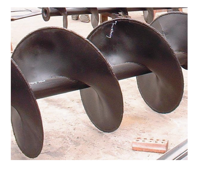
Figure 2. Screw conveyor with spiral crown hardfacing.

Screw conveyors are used for transporting materials in brick making plants and power plants. They are also used during the construction of tunnels and for unloading ships. Abrasive, and to a lesser extent, corrosive wears often occur