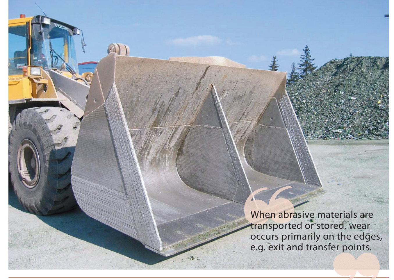
Figure 1. Loading equipment used for raw material transport in cement plants.

have been coated with the same hardfacing material and are manufactured industrially on a large scale. They can be purchased at the exact size and shape required for mounting. This results in cost savings and reduced downtime.